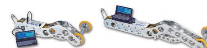
Prop II Meter ▲ F-Speed Reader