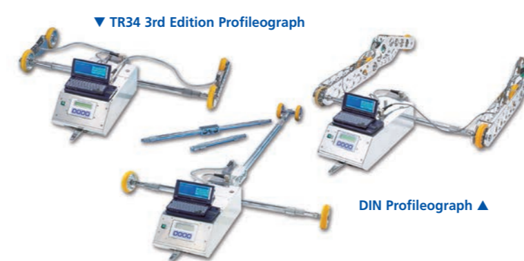
▼ TR34 3rd Edition Profilegraph